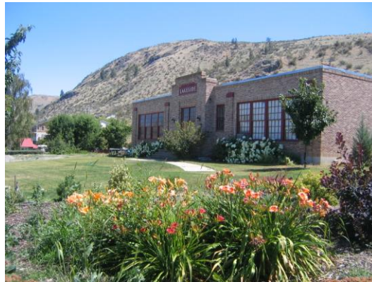
Old school now a single family residence