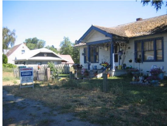
Residential transitioning to commercial use