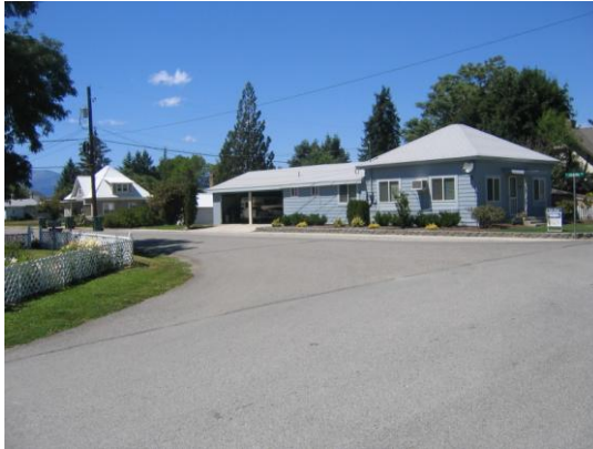
Older home for sale