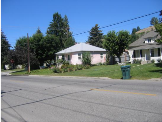
Typical older homes

A neighborhood with a mix of old and new homes and apartments, and also a mix of commercial and residential uses. It is adjacent to the town center and has a historic character. This area seems like it is already transitioning to higher density, multifamily uses, and yet many well-maintained single family homes still remain. Noise and parking could become issues in this area.