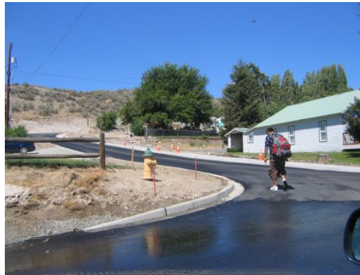
Street improvements underway- access to Whisper View Estates (30 lots) and 55 additional vacant lots above.