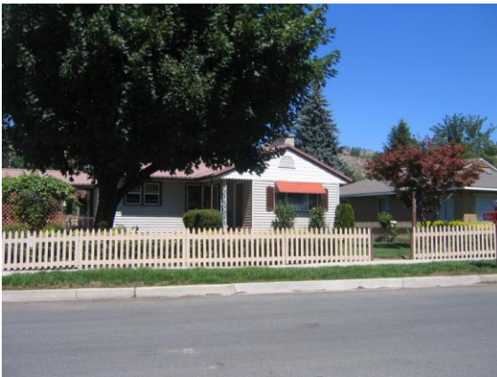
Typical home close to town center

A neighborhood with smaller homes, rougher streets, smaller trees and some manufactured homes/trailers. Most yards and homes are well-maintained. Walking distance to town center ~ 5 minutes. Adjacent to playing fields/park. Possible area for redevelopment?