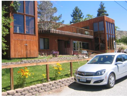
New duplex overlooking town