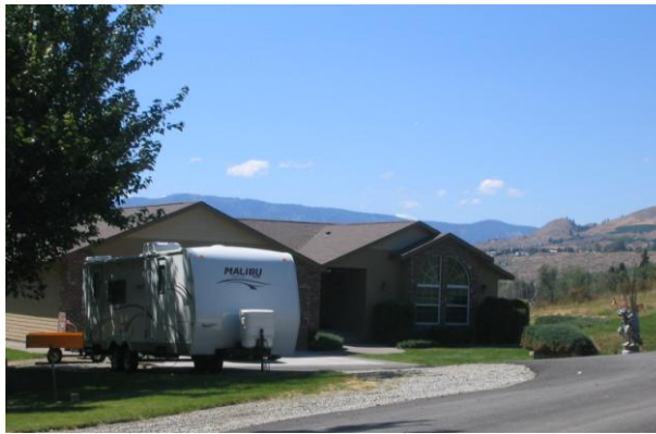
Typical home with improved driveway