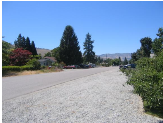
Gravel parking strip and wide streets