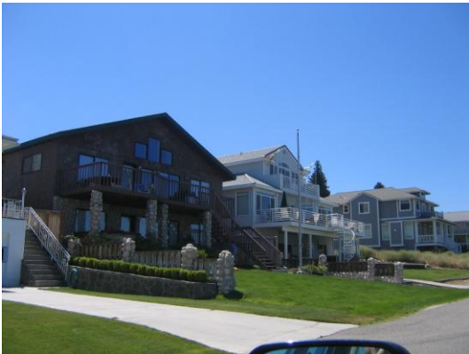
Typical lakefront homes

This is a resort-like area, with large homes along the lake, and likely many vacation homes. This area is not within walking distance to the town center, services or schools.