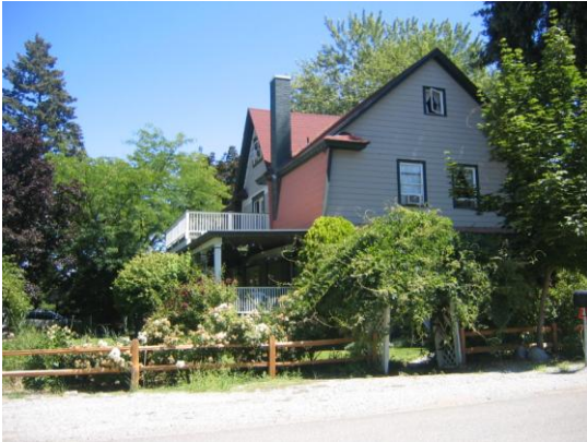
Typical older home