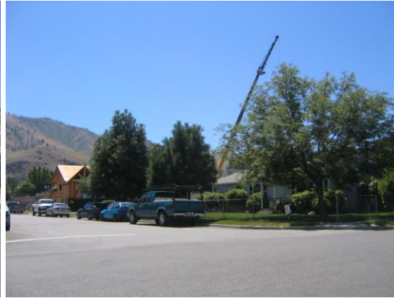
Development neighboring older homes