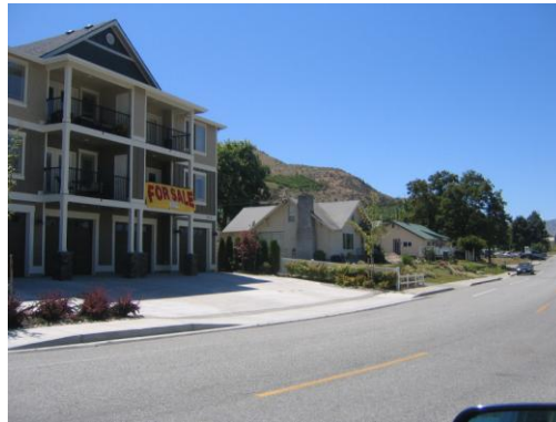
Condos for sale