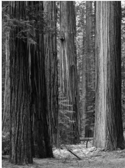
Conifers are the tallest (redwoods, above), oldest (bristlecone pines) and most massive (sequoia) organisms on the planet.

a few other genera occur world-wide. Larches rely on needles rather than broad leaves and they grow new needles every year (although the needles of juvenile trees may survive the first winter—perhaps protected by the forest canopy above). How do they do it? First, they grow in areas where there is little competition—other trees are not adapted to the harsh environments in which larches have established themselves. And second, they rely on efficient form and efficient use of nutrients to capture light and grow leaves and structural components.